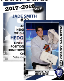
S1 & S2 Magnets