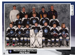
T- Team Photo